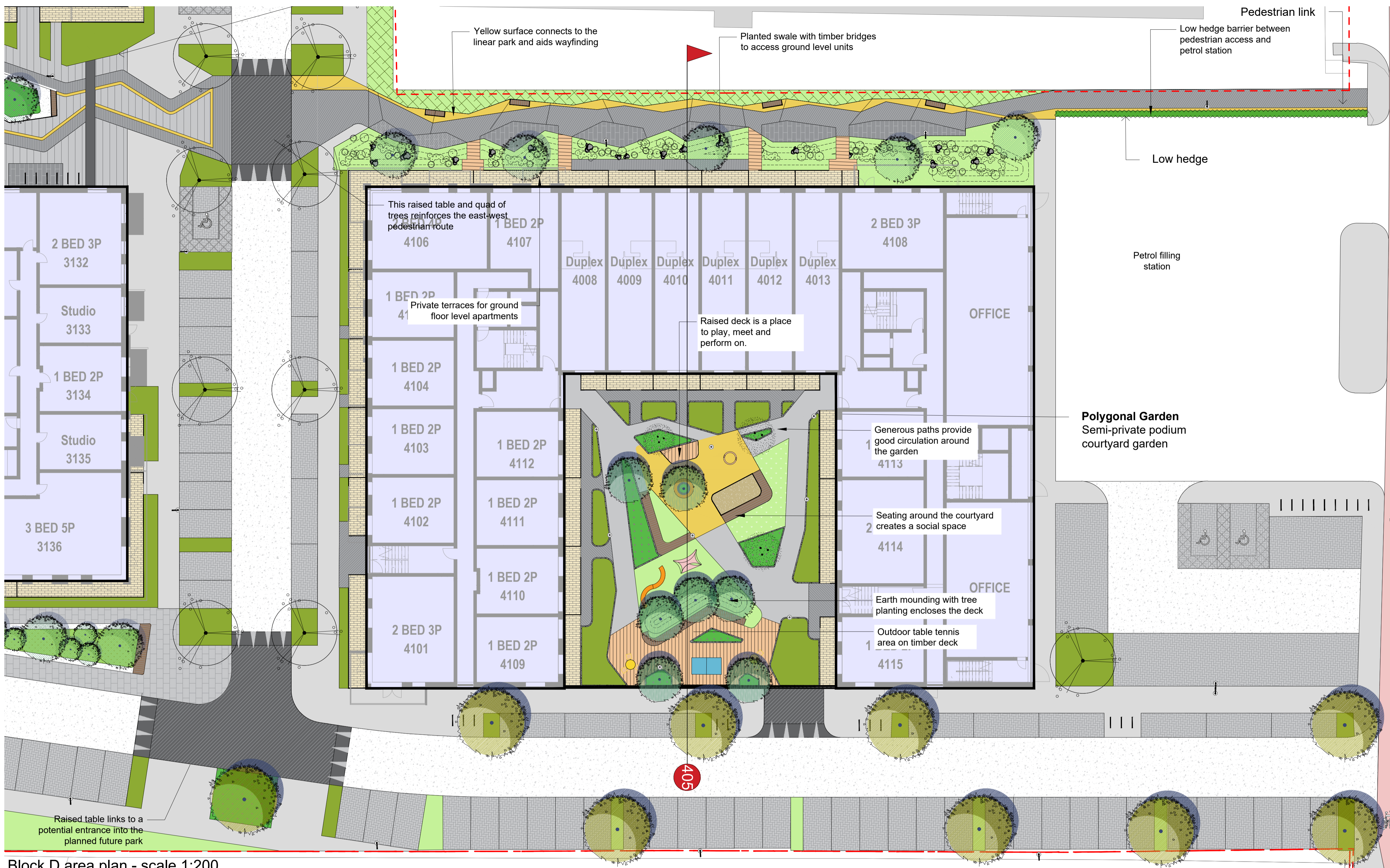
Block D area plan - scale 1:200